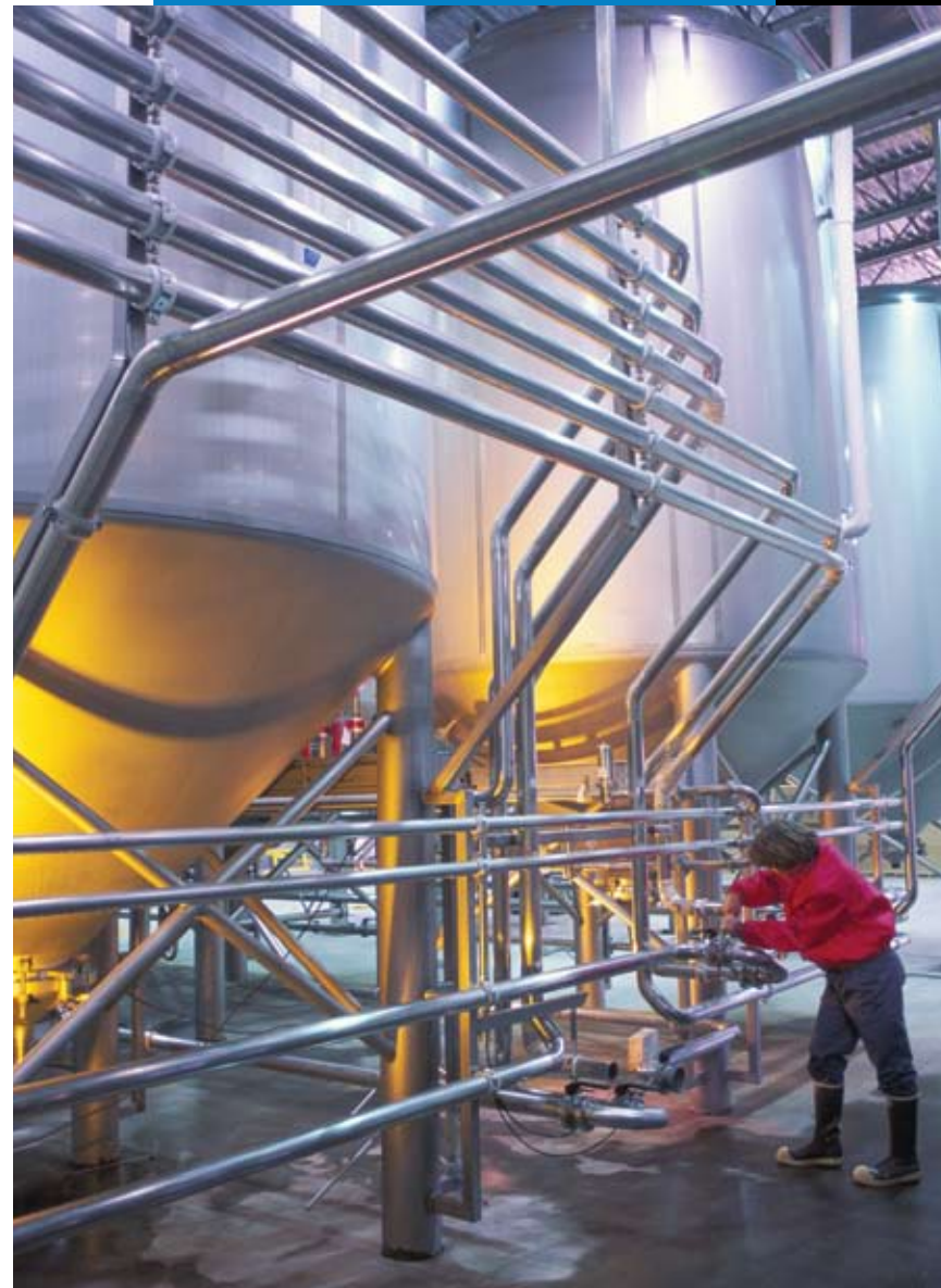
Mason Morfit/Getty Images

Protecto-Flex has performed 100 percent successfully during rigorous lab testing and 20 years of field installations. There is simply no better sealing product available for secondary containment. ▼